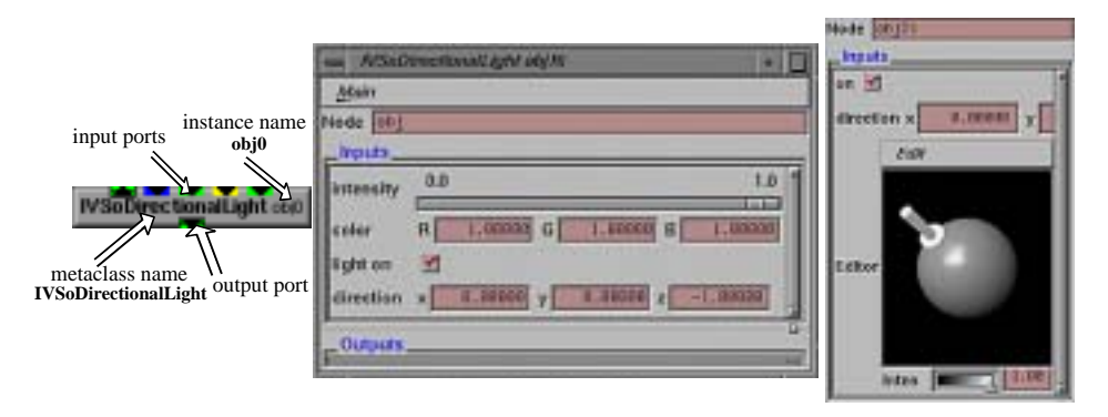
Figure 3. Left: Metaclass icon. The ports' graphical signs encode C++ type, by value/by reference and other attributes. Right: metaclass GUIs