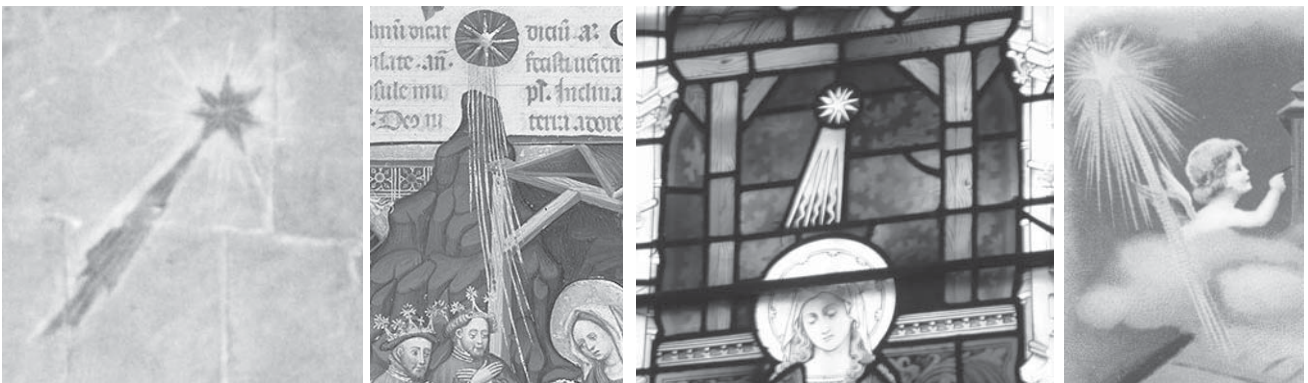
Figure 5. Examples of the Star of Bethlehem depicted as a comet in art. Left to right: from a painting in a side chapel in the Mezquita, Cordoba; from a 15th century illuminated manuscript by Martin of Aragon ( Bibliothèque Nationale de France ); a 19th century stained glass window in the parish church at Dunster, Somerset; from a 20th century Christmas card.

Matthew may have invented the star completely or it may have been based on oral stories of some manifestation in the heavens that occurred by chance at around the same time. The original stories, if such existed, could have been based on a different astronomical event or events. Such stories would have been based on something significant. This significance could either have been astronomical or astrological or both. The event didn't even necessarily have to be one based on a star. Consequently a conjunction that is