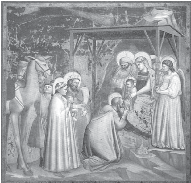
Figure 4. The Adoration of the Magi by Giotto di Bondone (Scrovegni Chapel, Padua).

It is reputed, though this has been questioned, 34 that another apparition of Halley's Comet inspired Giotto di Bondone in 1301 to depict it as the Star of Bethlehem in his fresco 'The Adoration of the Magi' 35 (Figure 4). The comet should have been an even better spectacle to Matthew than to Giotto. For reference, the 1986 apparition in the northern hemisphere was the faintest 36 for over 2,000 years.