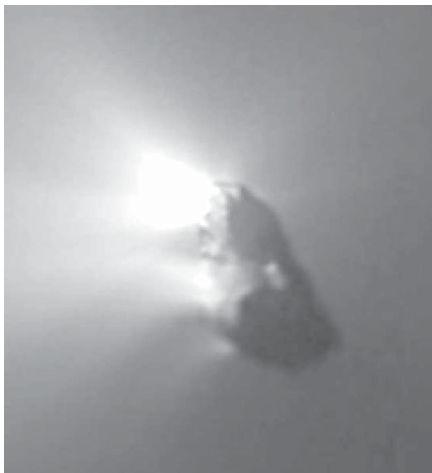
Figure 6. The heart of the Star of Bethlehem?

astrologically significant is not ruled out as the basis of any such oral stories. What is ruled out is any causal relationship between such an event and the birth of Christ.