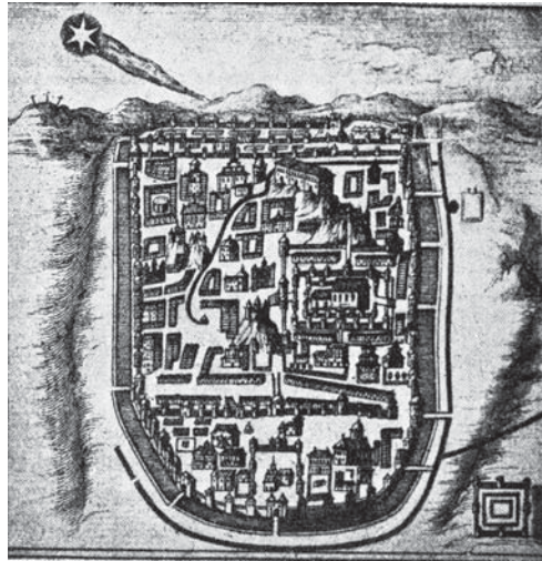
Figure 1. The comet 'hung over' Jerusalem in AD 66. From Stanislaw Lubieniecki, Theatrum Cometicum , 1681 edition.

Another interpretation of the meaning of Matthew introducing the Magi was to show good triumphing over evil. The sorcer-