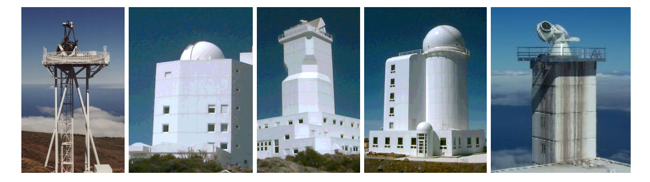
Figure 1: Portrait gallery of European groundbased telescopes in order of ascending aperture. From left to right: • DOT (Dutch Open Telescope), La Palma, aperture 45 cm, operational since 1999. Its fully open design minimises disturbance of the excellent atmospheric conditions at La Palma. Suited to high-resolution proxy magnetometry. A large-volume five-wavelength speckle pipeline system is being installed which will generate up to 0.5 Tbyte of wide-field tomographic imaging per observing day. Website: dot.astro.uu.nl.

Numerical modelling. Direct confrontation of observations with concerted numerical modelling has proven to be a particularly fruitful solar physics venue. Current ESMN collaborations led by UiO use actual data as simulation input in order to enable direct comparison with diverse observational diagnostics including spectral sequences from Canary Island telescopes and from SOHO. The same forward-modeling-plus-reproduction approach is taken by the ELTE team with regards to active region patterning and by AIP in simulating magneto-atmospheric waves in sunspot atmospheres.