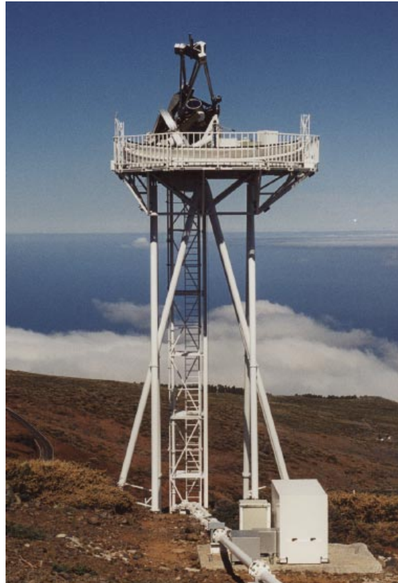
Figure 1: The Dutch Open Telescope on La Palma. The telescope and the 15 m high support tower are open to the trade wind from the North (to the right) which brings the best seeing to La Palma. When it blows sufficiently strong it confines the solar-heated boundary layer of turbulent convection to heights below the telescope and flushes the telescope itself. The parallactic telescope mount is extraordinarily stiff to avoid image shake from wind buffeting. A clamshell foldaway dome protects the telescope from (sometimes very) inclement weather. The telescope consists of a 45 cm parabolic primary (seen in the middle of the photograph) with 200 cm focal length. The primary image is mostly reflected away with a water-cooled mirror (the water storage tank is in the foreground). A small hole (1.6 mm) transmits the field of view. The slender on-axis pipe at the top of the telescope contains the focusing mechanism, re-imaging optics, the G-band filter and the G-band camera. The other four cameras of the multi-channel imaging system will be mounted at the telescope top besides the incoming beam. The speckle frames are transported by optical fibers (in the pipe) to a large-capacity data acquisition system in the Swedish solar telescope building from which the DOT is operated.

Figure 2 shows a sample G-band image from the first camera. It illustrates the high resolution achieved with the DOT and it also illustrates the important advantage that speckle processing has over adaptive optics: the whole field as delimited by the camera chip is restored to the 0.2'' diffraction limit (through splitting the full image into hundreds of isoplanatic patches that are treated independently). This quality is reached whenever the La Palma seeing is moderately good, i.e. , Fried parameter r_0 \approx 10 cm.