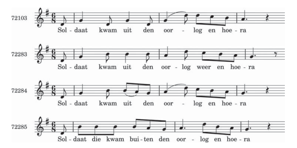
Fig. 1. Incipits of four members of the tune family Soldaat . The melodies are identified by their record number in the Dutch Song Database (http://www.liederenbank.nl). The full melodies and recordings can be accessed by entering the record number in the search box on the site of the Dutch Song Database.

All features for which absolute pitch is needed (e.g. Steinbeck's Mean Pitch) are discarded because the melodies are represented in various keys. The low-level, multidimensional features from the set of jSymbolic that are primarily needed to compute the values of other, higher-level features are discarded as well. Furthermore, categorical features and features that have the same value for all songs have not been included. Thus, we have a set of 88 features, which we characterize as 'global' because for each feature an entire song is represented by a single value. The complete list of features with descriptions is included in Appendix A.2.